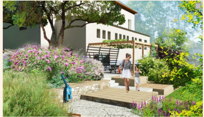
Illustrative drawings from the community rain garden design