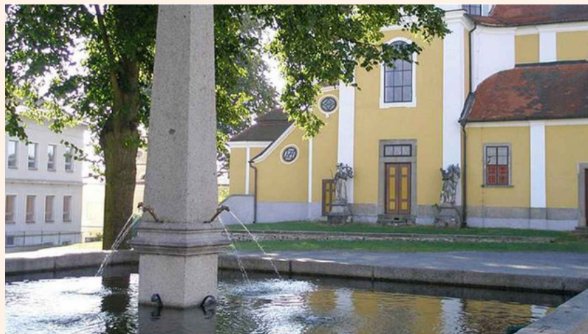
Shady fountain, 2011

Some residents were motivated to 'do something' by their disillusionment with the municipality's decision not to fund the results of the square redesign process. Others, according to Lucie, were angry that the previous municipal administration had cut down the mature shade trees surrounding the fountain on the square.