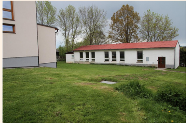
Community rain garden site before the changes

Lucie knew of the possibility to obtain a small grant from Via Foundation in Prague and, based on agreement with the group of 7 women, she prepared a grant proposal to engage residents in transforming the garden site. In May 2019, she submitted it on behalf of a non-profit organization that she had co-founded and run for many years.